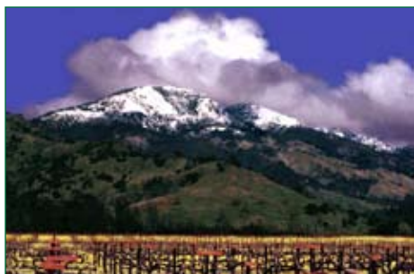
Mount St. Helena and Robert Louis Stevenson State Park.

4 St. Helena, California — For the ultimate wine country experience in California, there is only one place