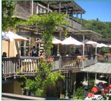
Auberge du Soleil

And look at some of the famous names that call Rutherford home: Beaulieu Vineyard, Flora Springs, Pine Ridge, Quintessa, Rubicon, Sullivan